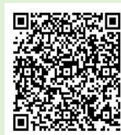
Google Play (Android)

For more information about the app, please check the Digital Agency Website