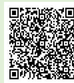
App Store (iOS)